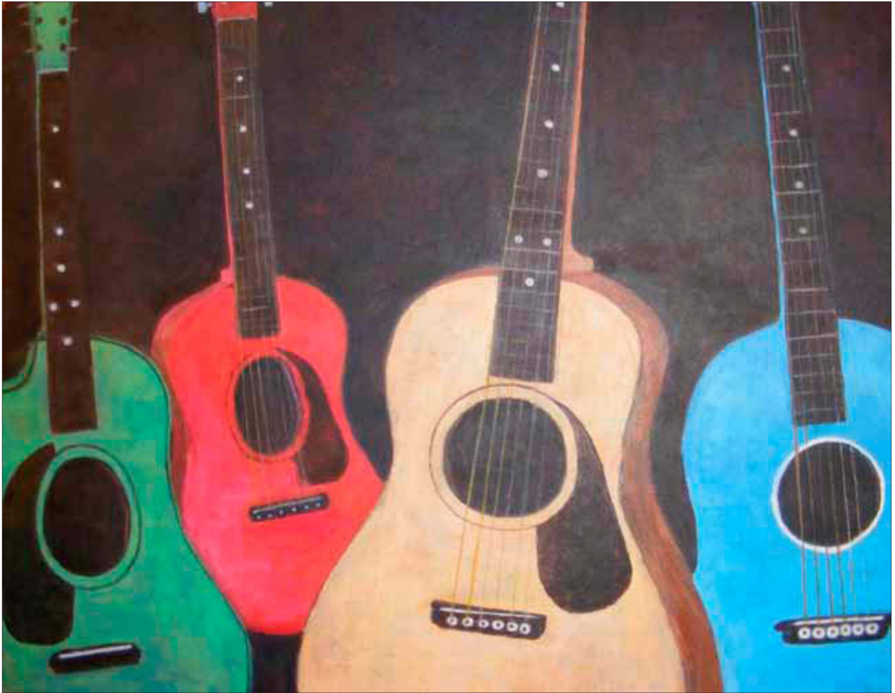
"Four Guitars" 24x30 acrylic on canvas