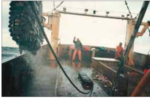
Keep it Gentle

He is signaling the winch man to gently land the Scallop dredge on the deck in a heavy sea.