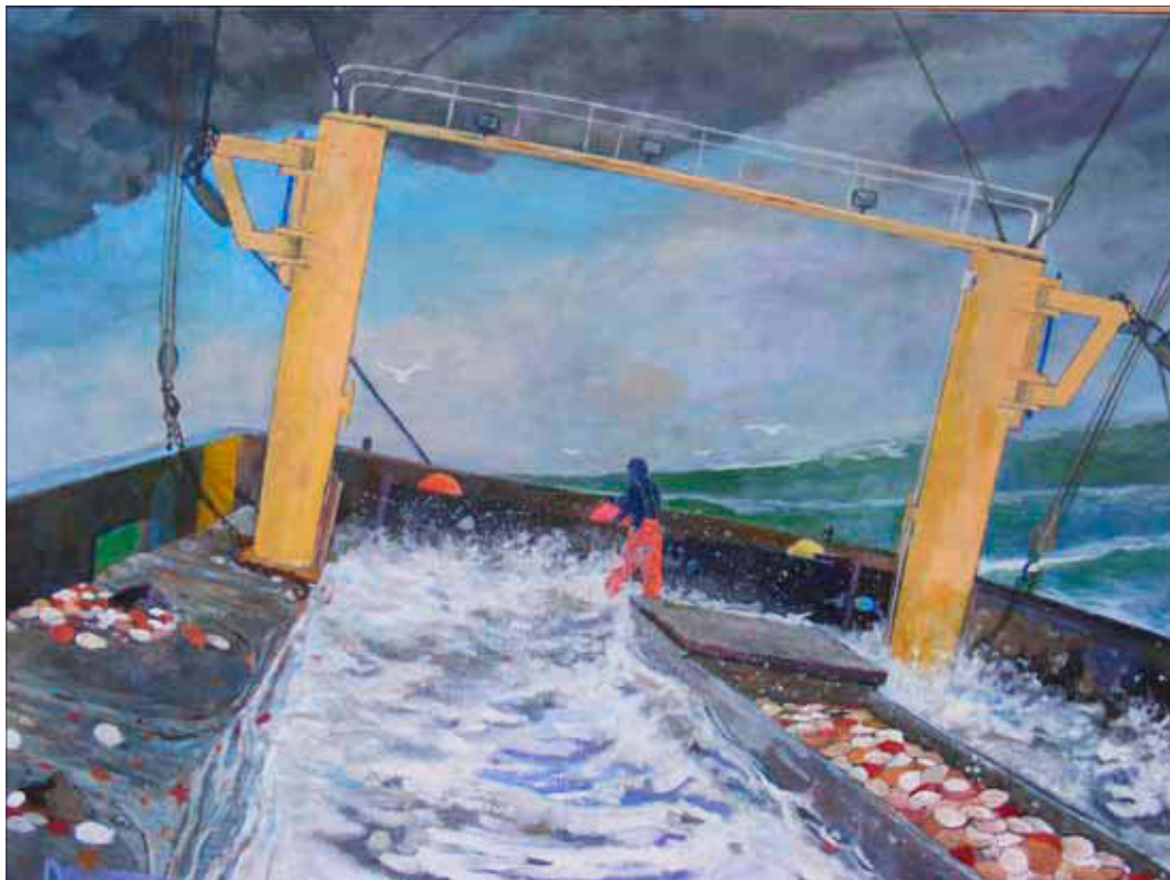
"Scalloping the Great South Channel" 30x40 acrylic on canvas

This is one of those you have to be there paintings, and I was. This is one of those paintings that tell the story of a fisherman's life. (I like it)