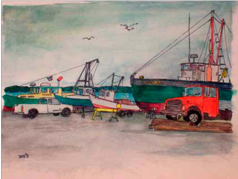
"Wellfleet Pier" Donated to Homeless Prevention Coalition Auction to support needs of the homeless. 8x10 watercolor pen and ink on paper