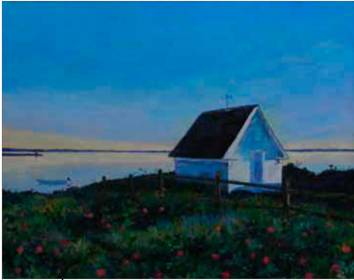
"Pump House" Song "I Miss You" 36x48 acrylic on canvas