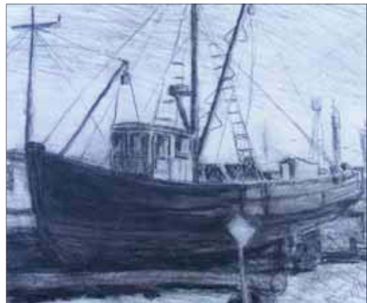
charcoal: fishing boat at dock

For two hundred years Provincetown was one of the biggest ports for commercial fishing. I am so thankful I once worked on the wharf when it still was. We would sit and wait for the boats to come in with their catch after a week or two at sea. I sometimes would spend hours standing on a mountain of ice in the ice house, shoveling ice down a shoot into the boats getting ready to go to sea, or working the winch for the ones just returning. The winch brings the containers of fish up to be emptied onto a metal ramp, and sorted by a crew who were the toughest, foul mouth, and hard working