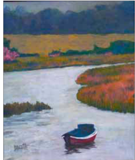
"Oyster Creek" song "River" 14x20 acrylic on canvas

She has tough Irish roots, street smart and savvy.