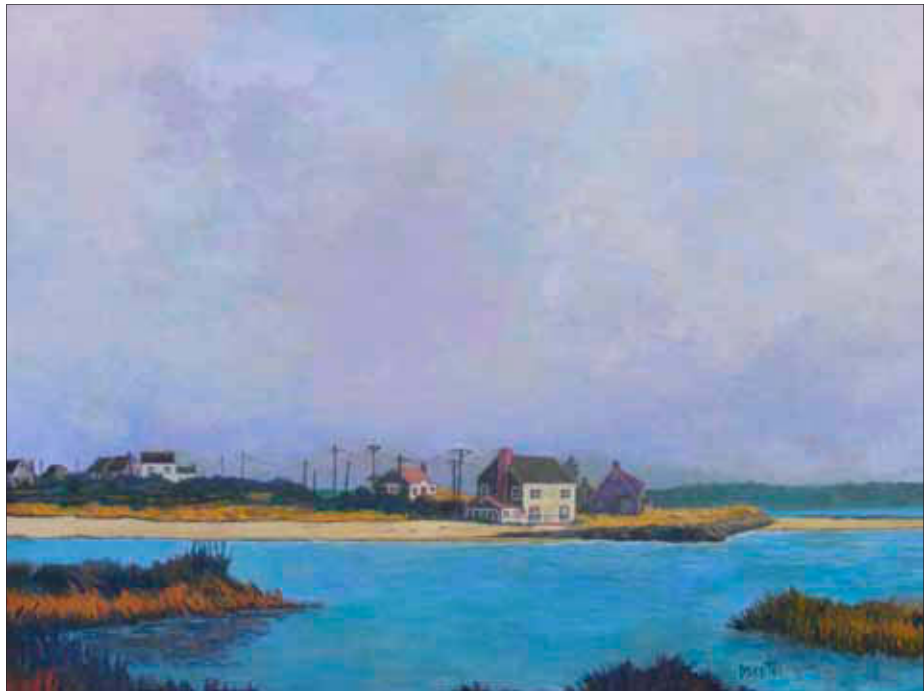
"Across the Way" 36x48 acrylic on canvas