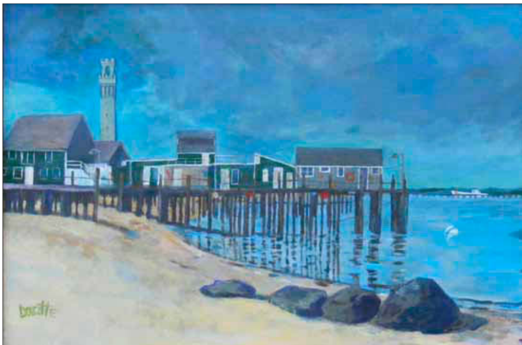
"Captain Jack's Wharf" Donated to Homeless Prevention Coalition 16x24 acrylic on canvas