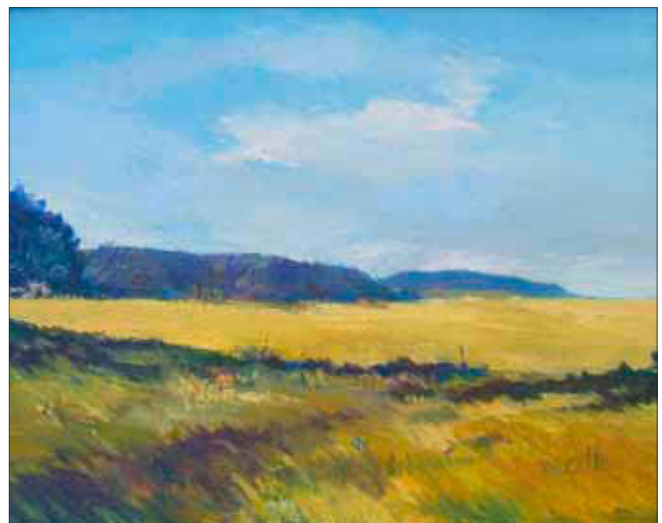
"Black Fish Creek" 16x20 oil on canvas