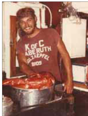
Off Shore Cooking

guys in town. The fish would be slid down into boxes, sometimes my job was to shovel the ice on top and nail the covers on and hand truck them to the trucks that transport them to fish markets, and restaurants.