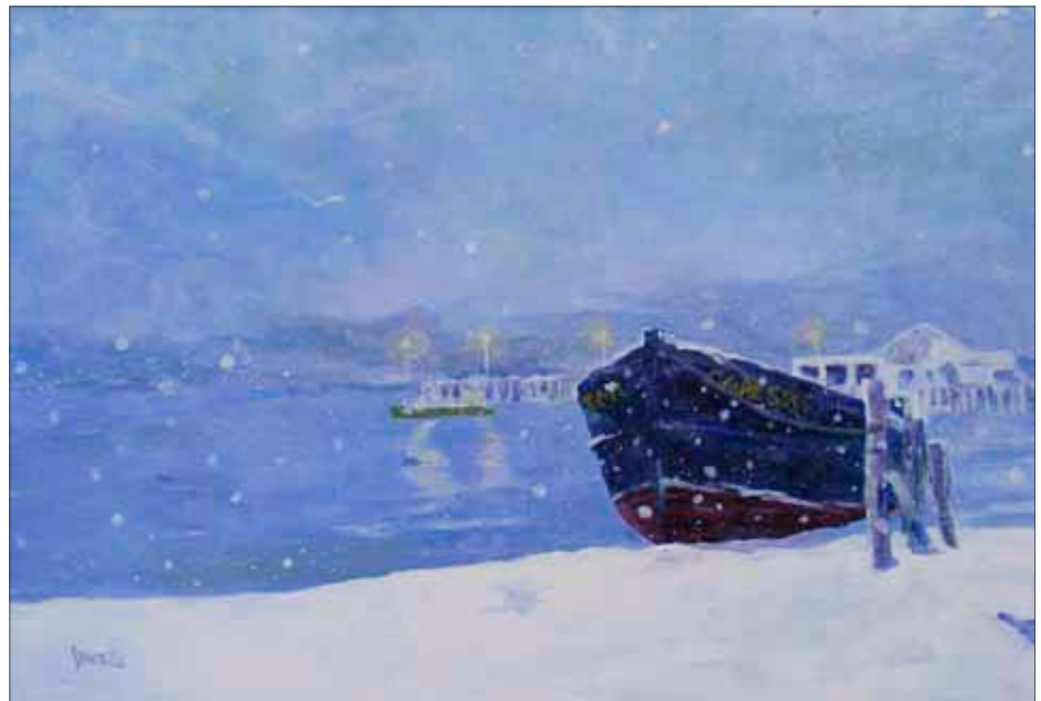
"F/V Cape Star" 36x24 acrylic on canvas