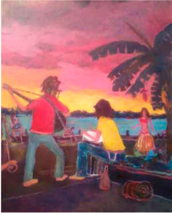
"Memories of Mallory Square" song "Change On" 16x20 acrylic on canvas