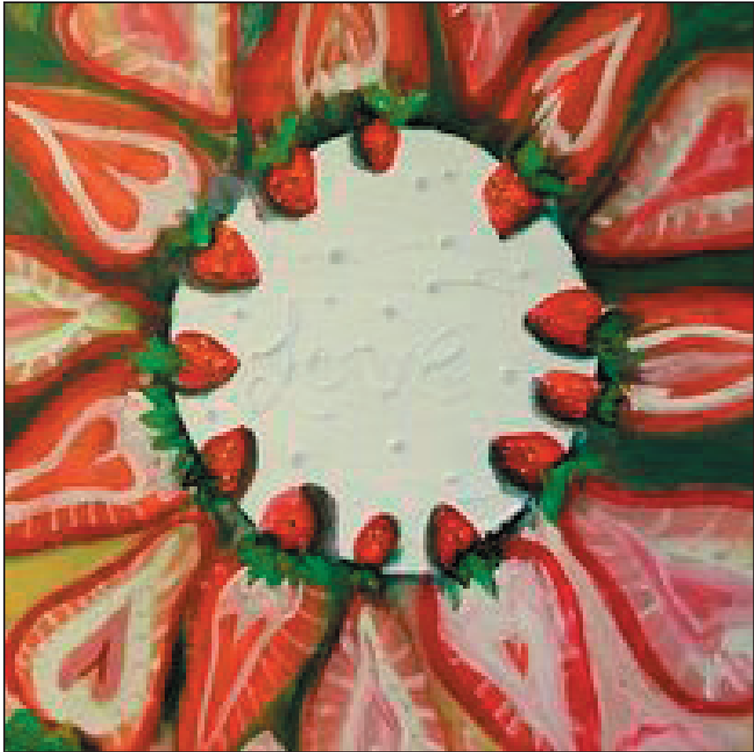
Strawberry Moon Pie 20x20 oil on canvas 2012