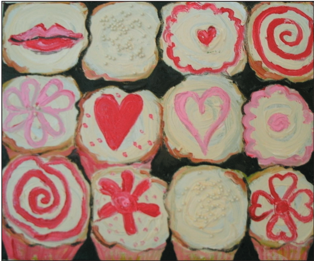
Love and Cupcakes 8x12 oil on canvas 1999