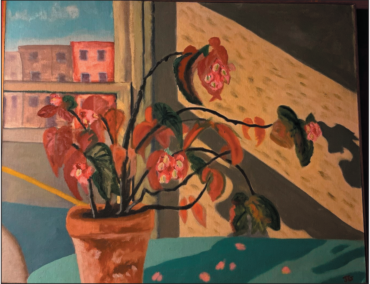
Angel Wing Begonia 24x36 oil on canvas 1985