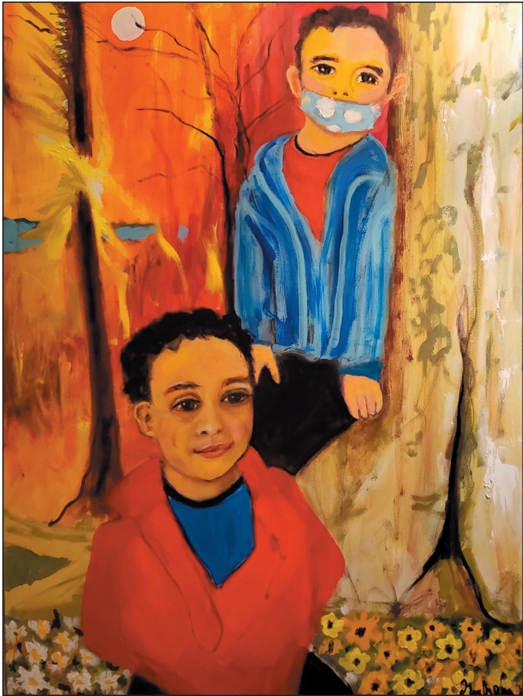
Sam and Solly 2020 36x48 oil on canvas 2020