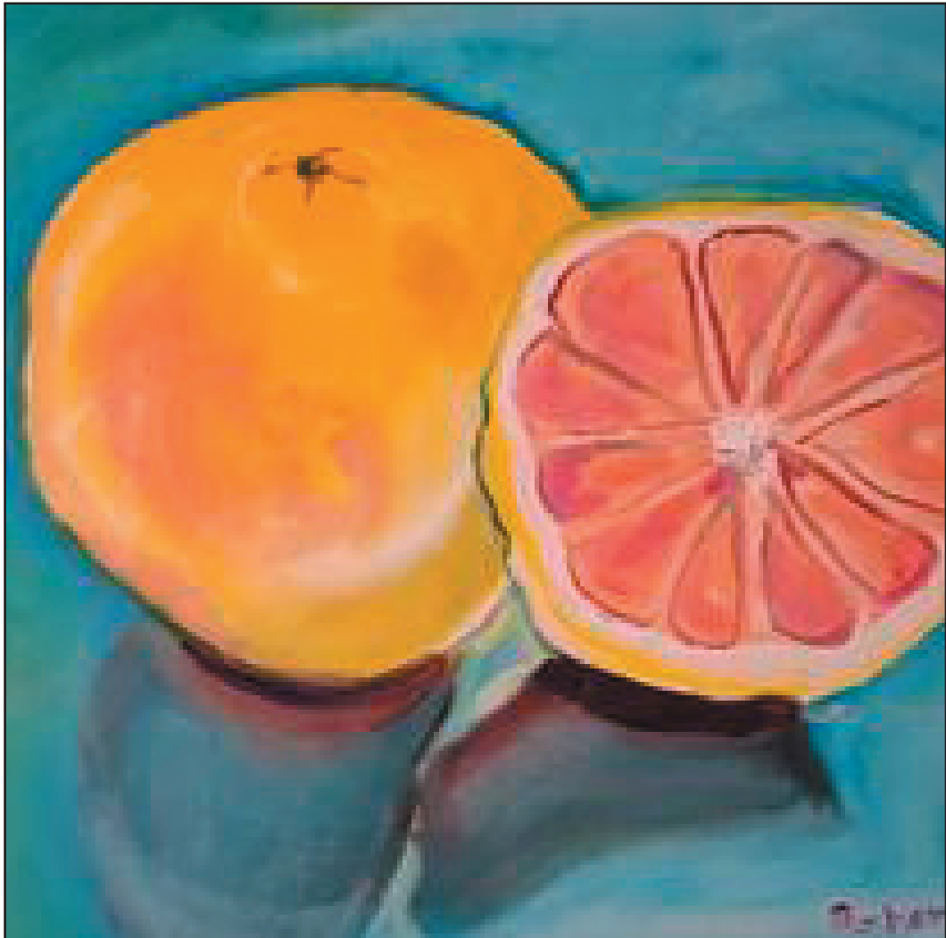
Pink Grapefruit 10x12 oil on canvas 2005