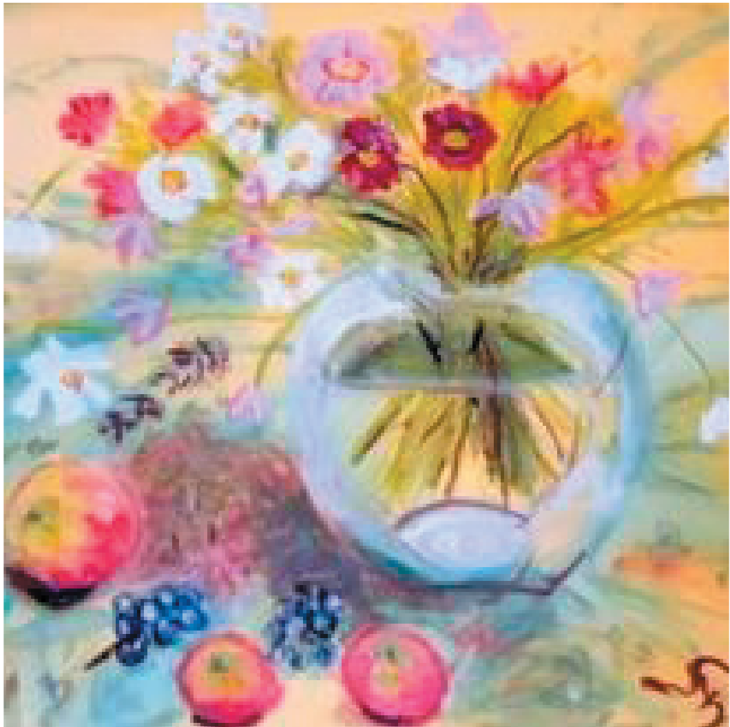
Rhinebeck Flowers 18x24 oil on canvas 2010