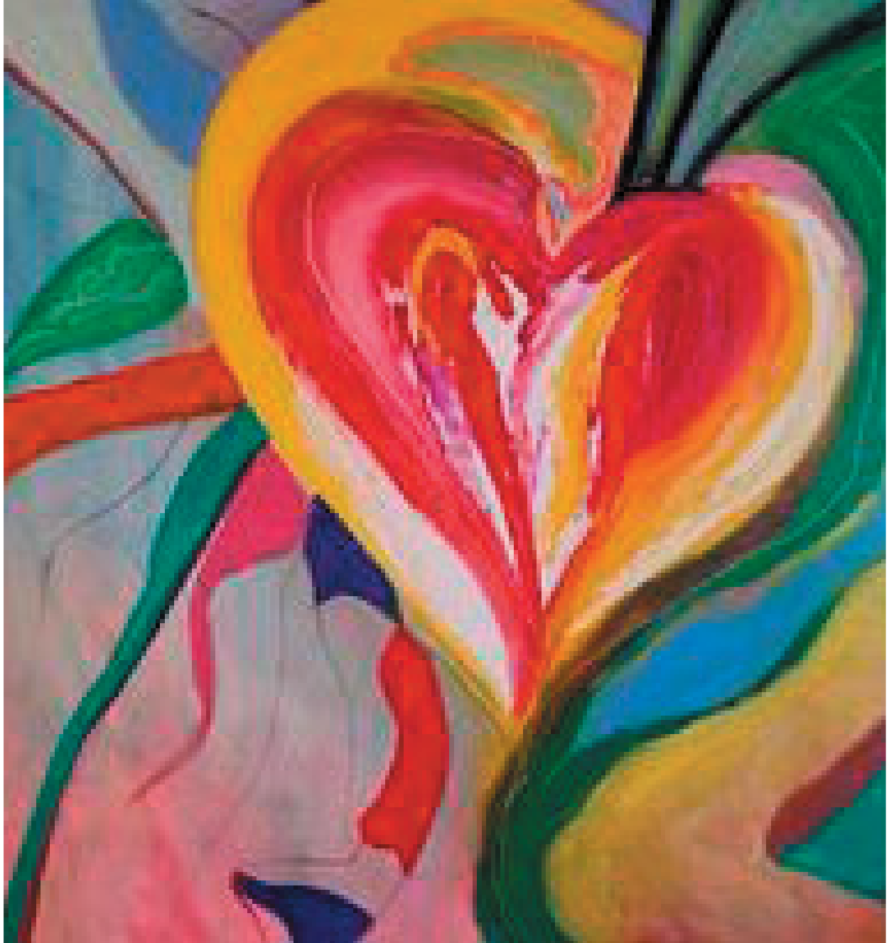
Jim's Big Heart 36x48 oil on canvas 2017