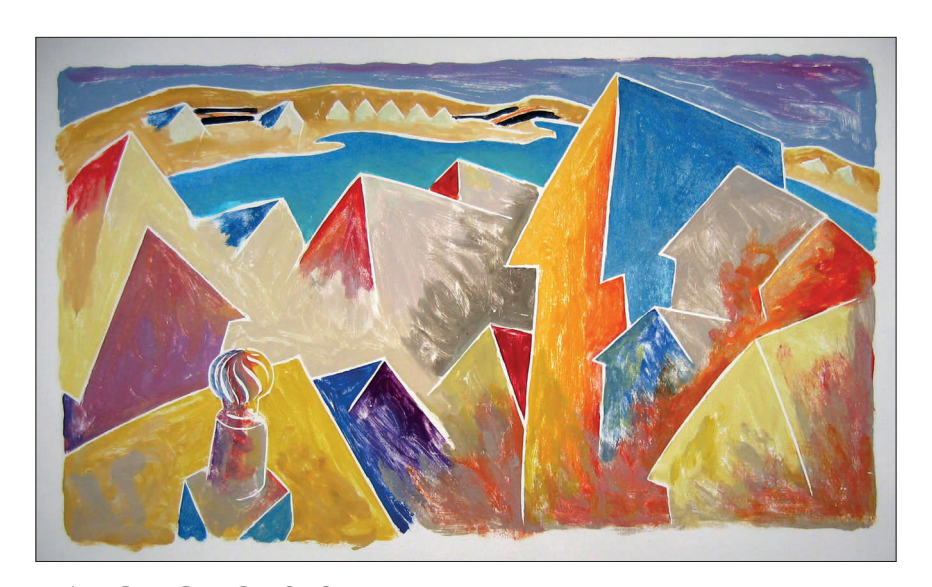
DANCING HOUSES II, 2010 (wood block carved 1992), white-line color woodcut printed in oil ink and paint, 20'' \times 36''