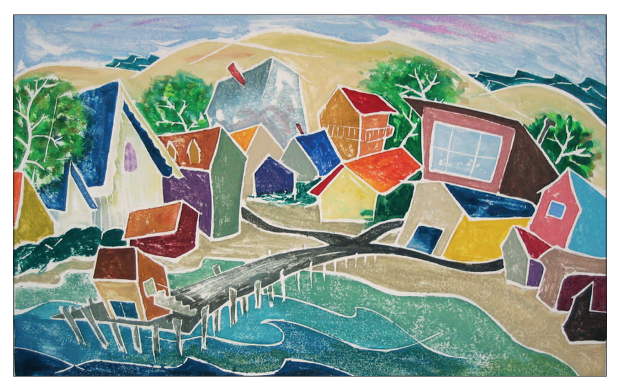
DANCING HOUSES, 2014 (wood block carved 1984), white-line color woodcut 11 ½ x 17 ½"