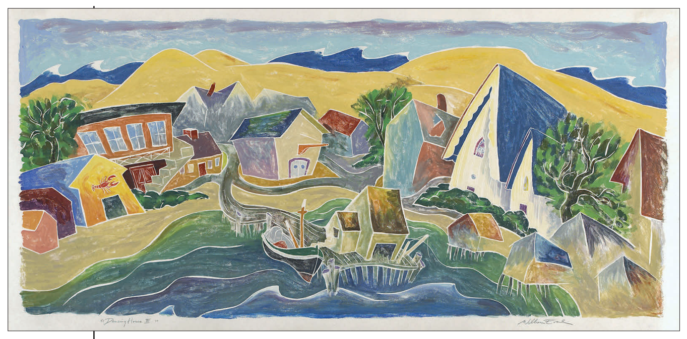
DANCING HOUSES III, 2006 (wood block carved 1992), white-line color woodcut printed in oil ink and paint, 34'' \times 70''