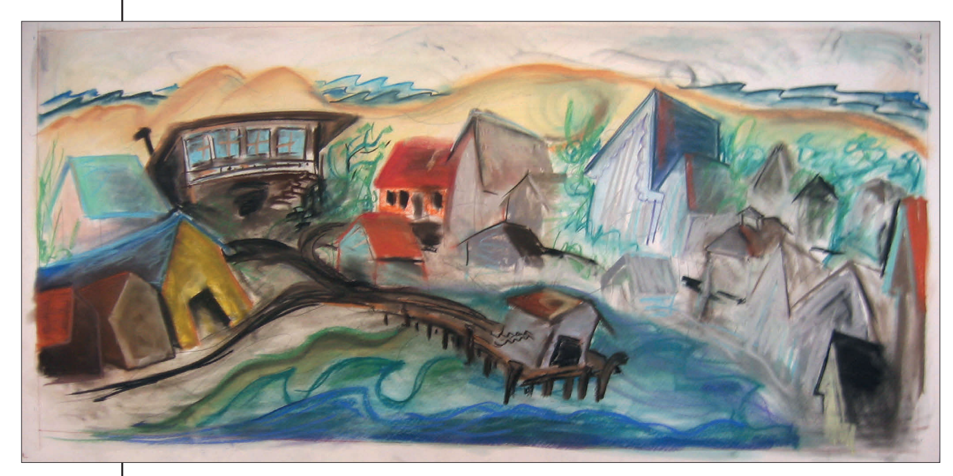
DANCING HOUSES III (study), 1990 Mixed media on rag paper, 36" x 76"