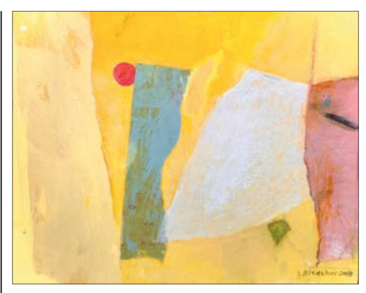
Let's Play, mixed media painting with acrylic paint, ink, graphite, color pencil, and oil pastel on paper, 10.5" X 13"