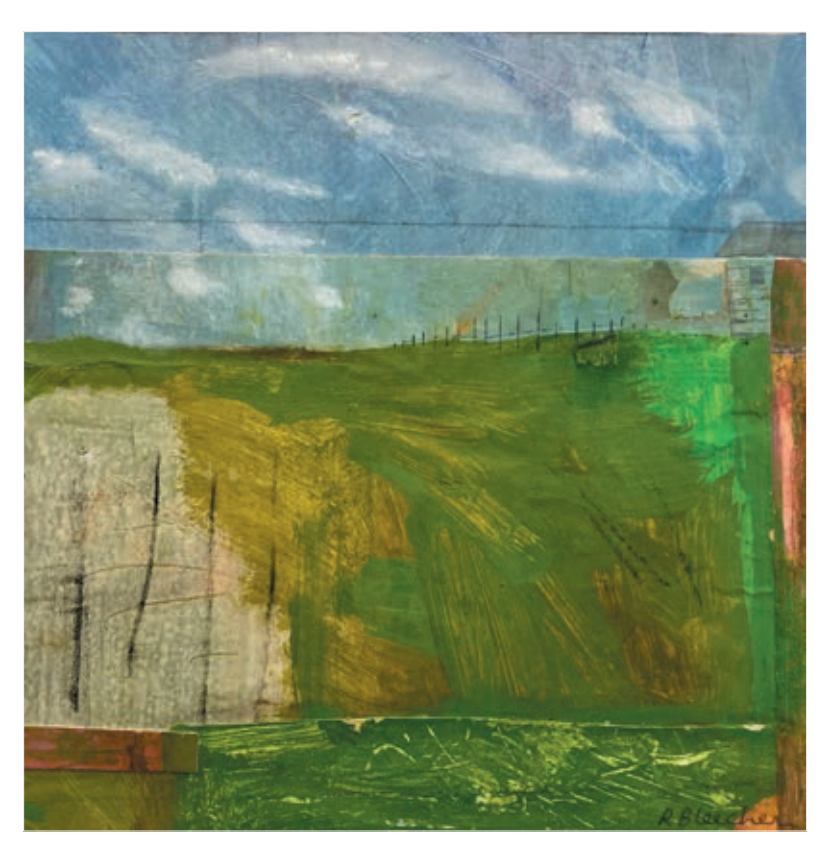
Farmland, mixed media painting with acrylic, charcoal, graphite, pencil, colored pencil, and ink pen on paper, 17.5" X 17"