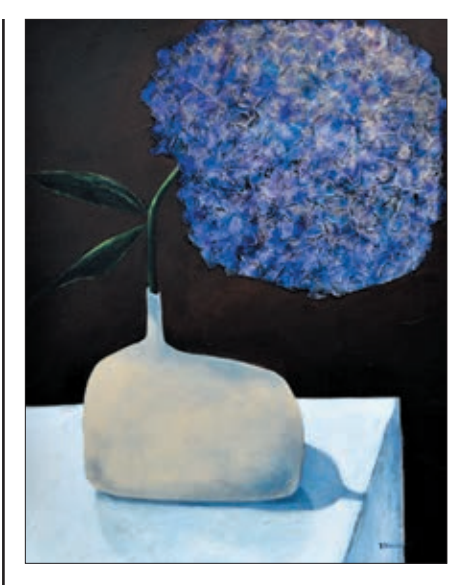
Hydrangea, acrylic, acrylic medium, and oil paint on board, 30" X 24"

toward the spiritual in terms of both theme and process. I began a healing practice and the subjects of my art became healers and deities. I had found my calling. Soon I found myself creating intuitive abstract compositions using mixed media: paint, charcoal, graphite, oil sticks, oil pastel, tar, cold wax, encaustic, burnt paper, tree bark, etc. Some of the pieces have a sense of mystery or curiosity that I loved as a child. There is a sense of the abstract forms having personas, and others with a feeling of flying over neighborhoods, natural settings, and cities that I relate to shamanic journeying. The application of the medium varies painting to painting, from bold color to subtle intricacies depending on where I feel drawn.