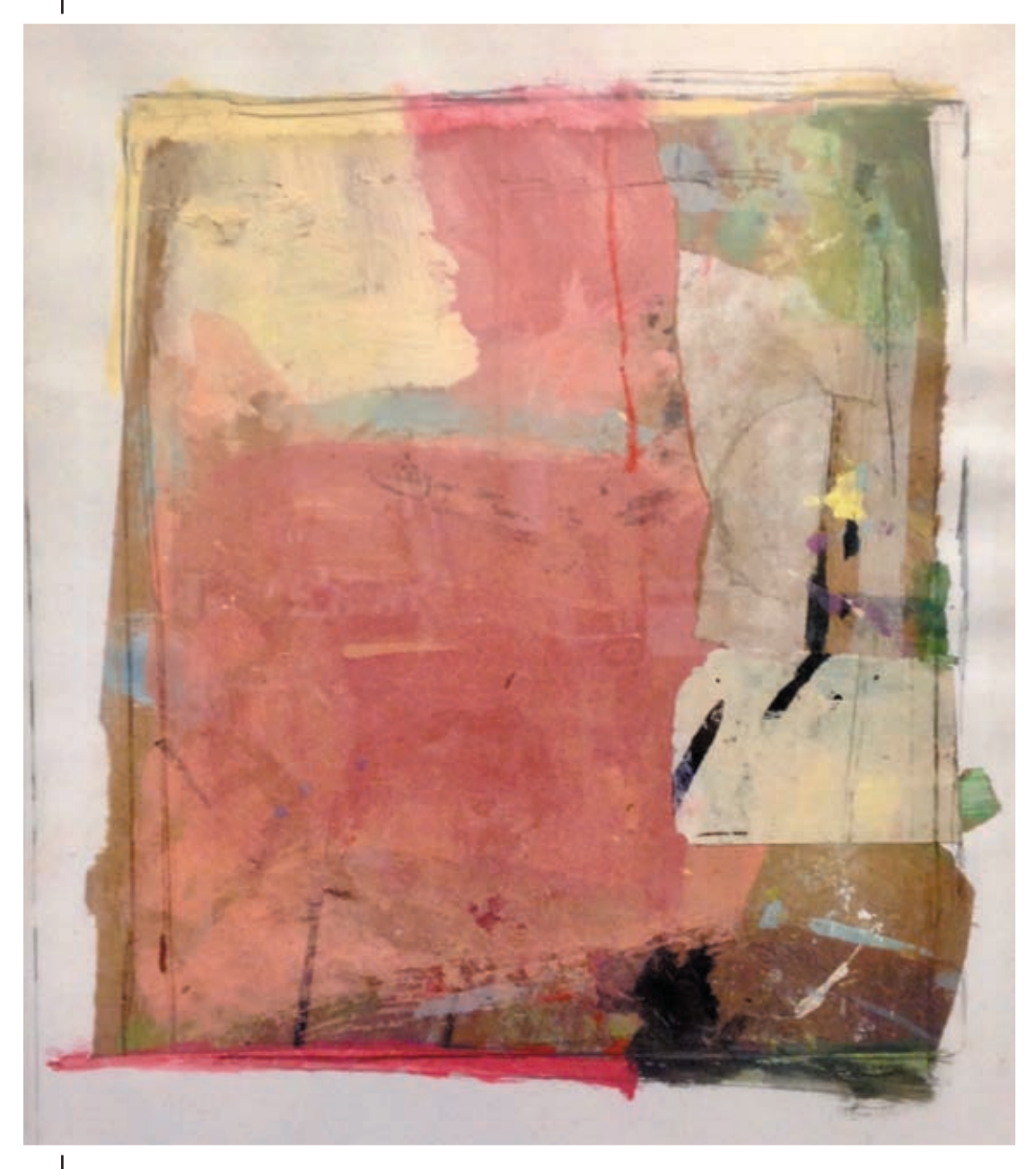
Shifting Awareness, mixed media painting with acrylic paint, graphite, pencil, paper, and ink on paper, 16^{\prime\prime} X 13^{\prime\prime}