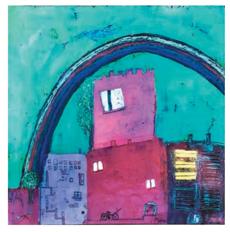
Somewhere Over the Rainbow, encaustic, oil pastel, and oil stick on cradled wood panel, 20" X 20"

My process is intuitive; sometimes clumsy and messy, sometimes fluid and breathtaking. Art has become a conscious