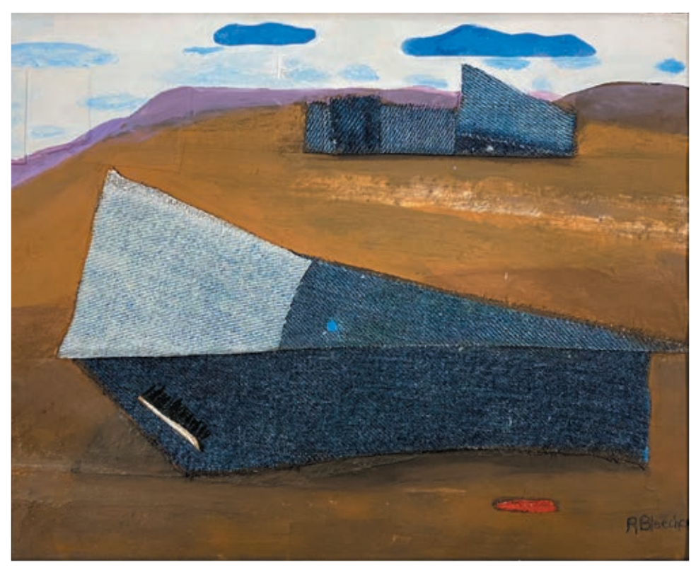
Sojourner's Rest, mixed media collage with acrylic paint, dungaree, leather, ink on paper, 11^{\prime\prime}~X~13^{\prime\prime}