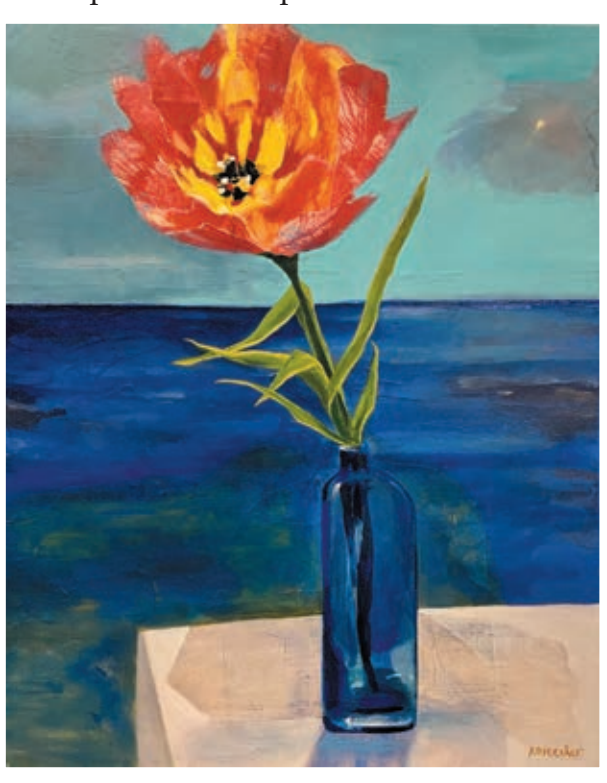
Red Tulip in Blue Bottle, mixed media painting with paper, acrylic paint, oil paint, and graphite on canvas, 30" X 24"

<u>Https://www.instagram.</u> <u>com/rebeccableecher</u>