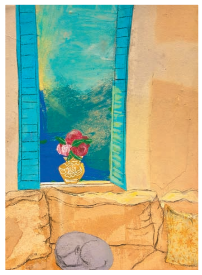
Morning Light, mixed media with paper, acrylic paint, charcoal, graphite, and paint pen on paper, approx. 14" X 10"