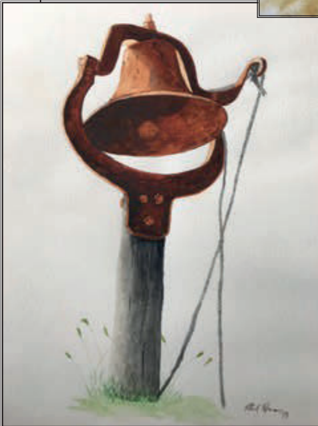
Dinner Bell #1