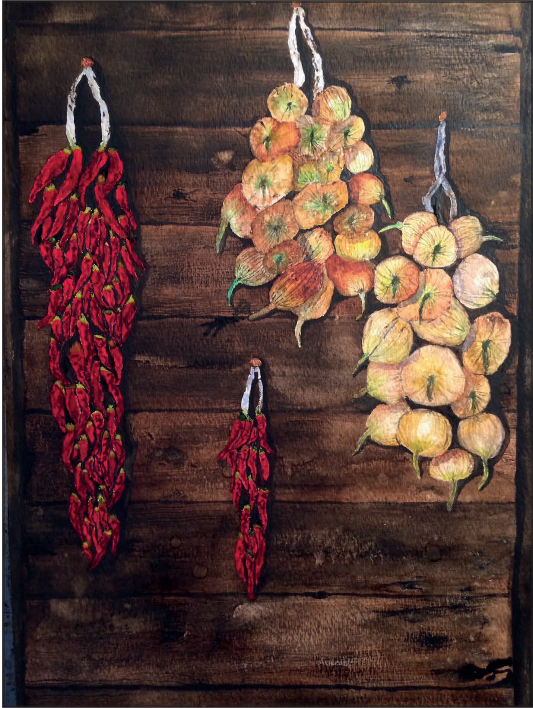
Peppers and Onions