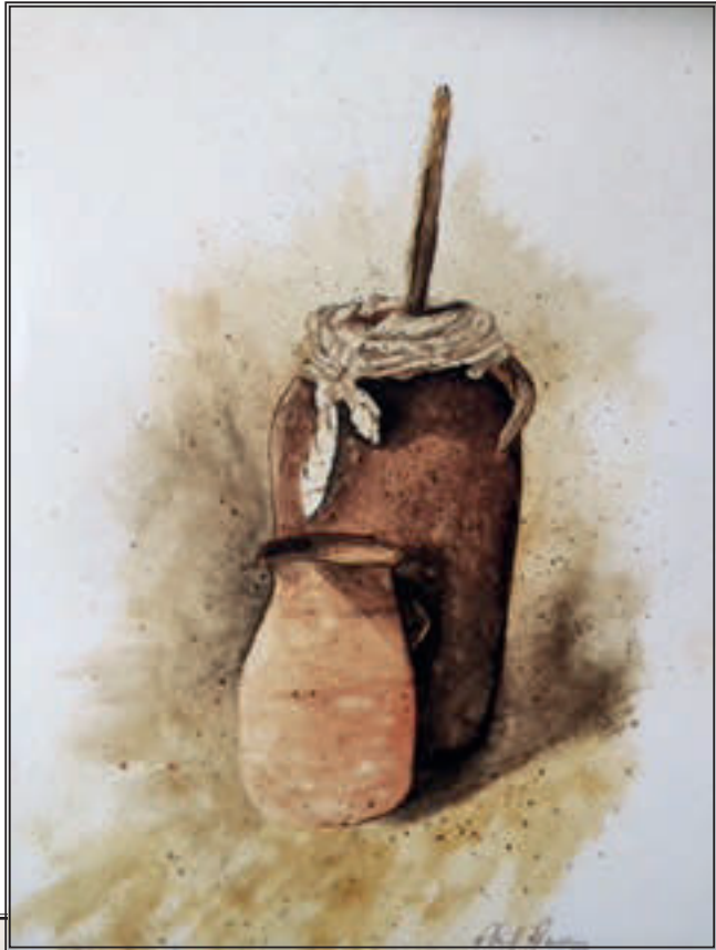
Churn and Pitcher