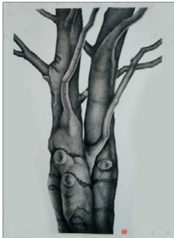
Entwined graphite and conte on paper 50.5"x 35.5"