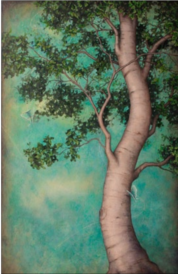
Luna Moth oil on canvas 60"x 40"