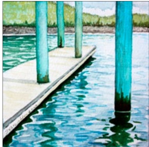
Harbour 2 watercolor on paper 4" x 4" (unframed)