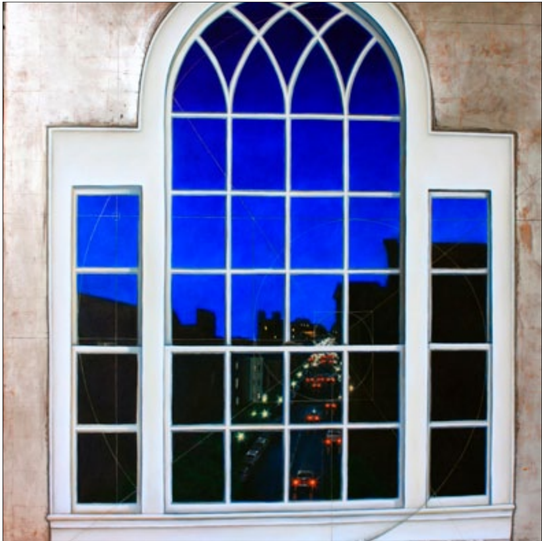
Charles St. oil on canvas with silver leaf 6'x 6'