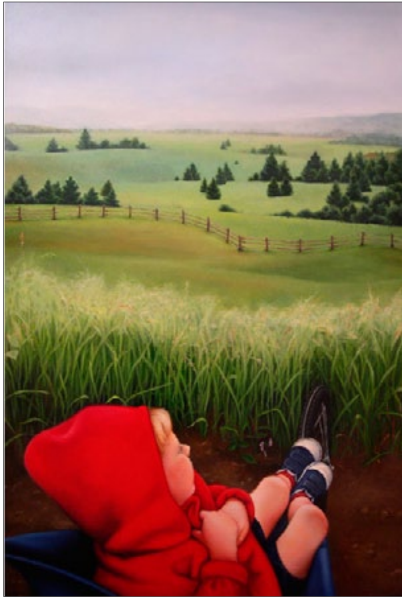
First Travels oil on canvas 53"x 36"