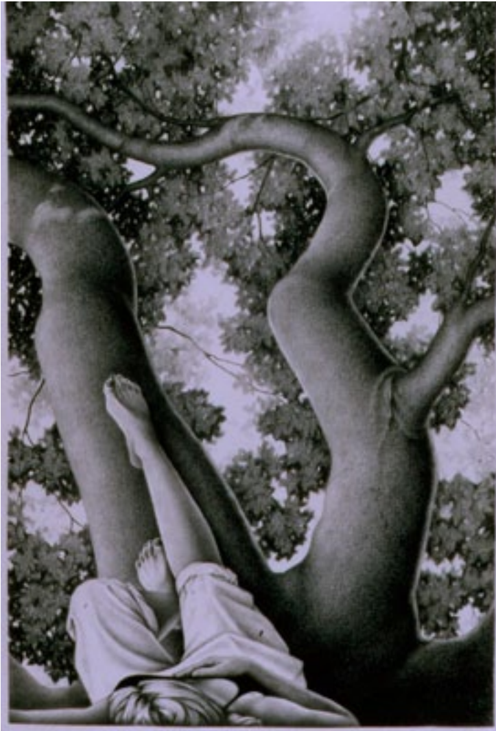
Sitting in a Beech graphite and conte on paper 71"x 50"