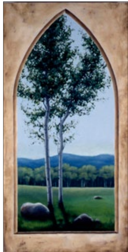
Birch 2 oil on canvas 48"x 36"