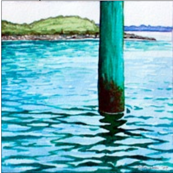
Harbour 1 watercolor on paper 4" x 4" (unframed)