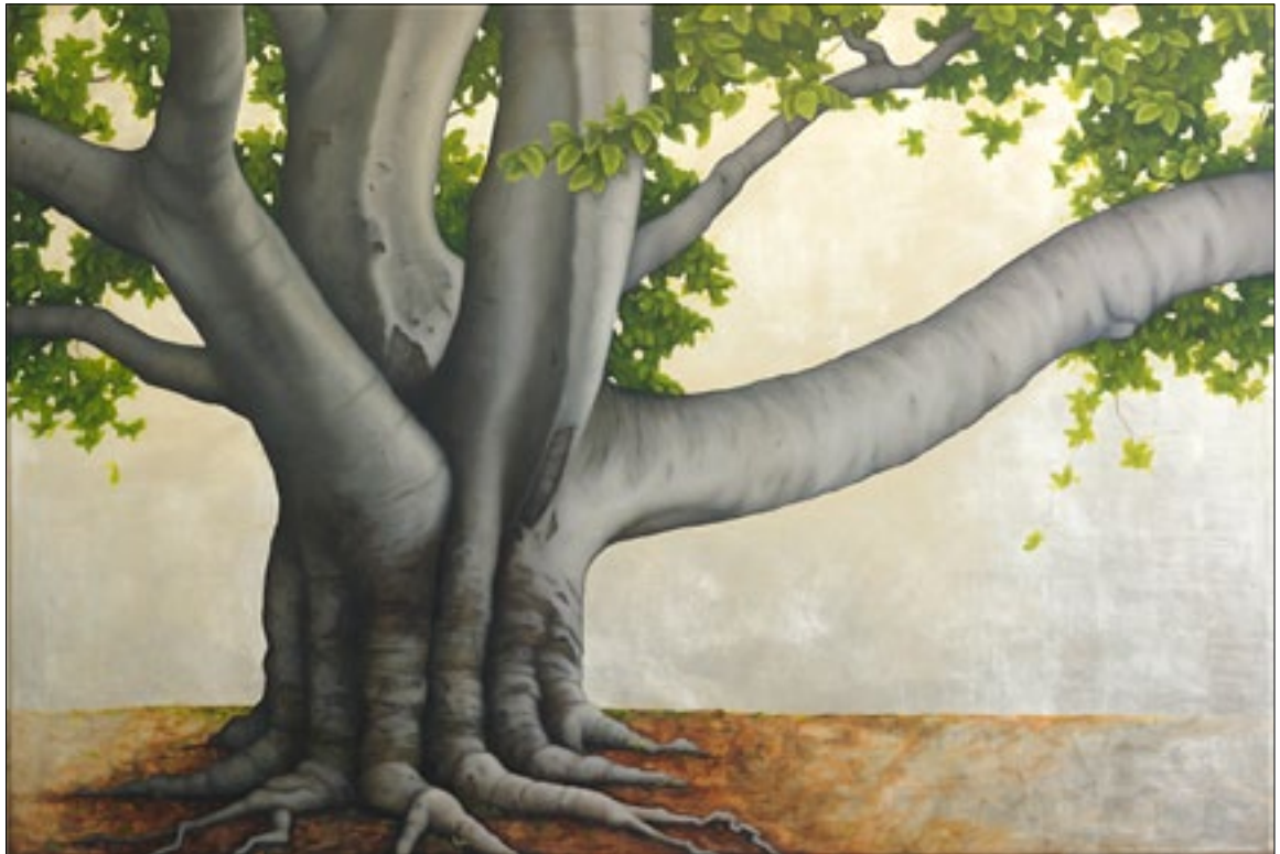
Brook's Beech oil on canvas with white gold leaf 7'x 5'