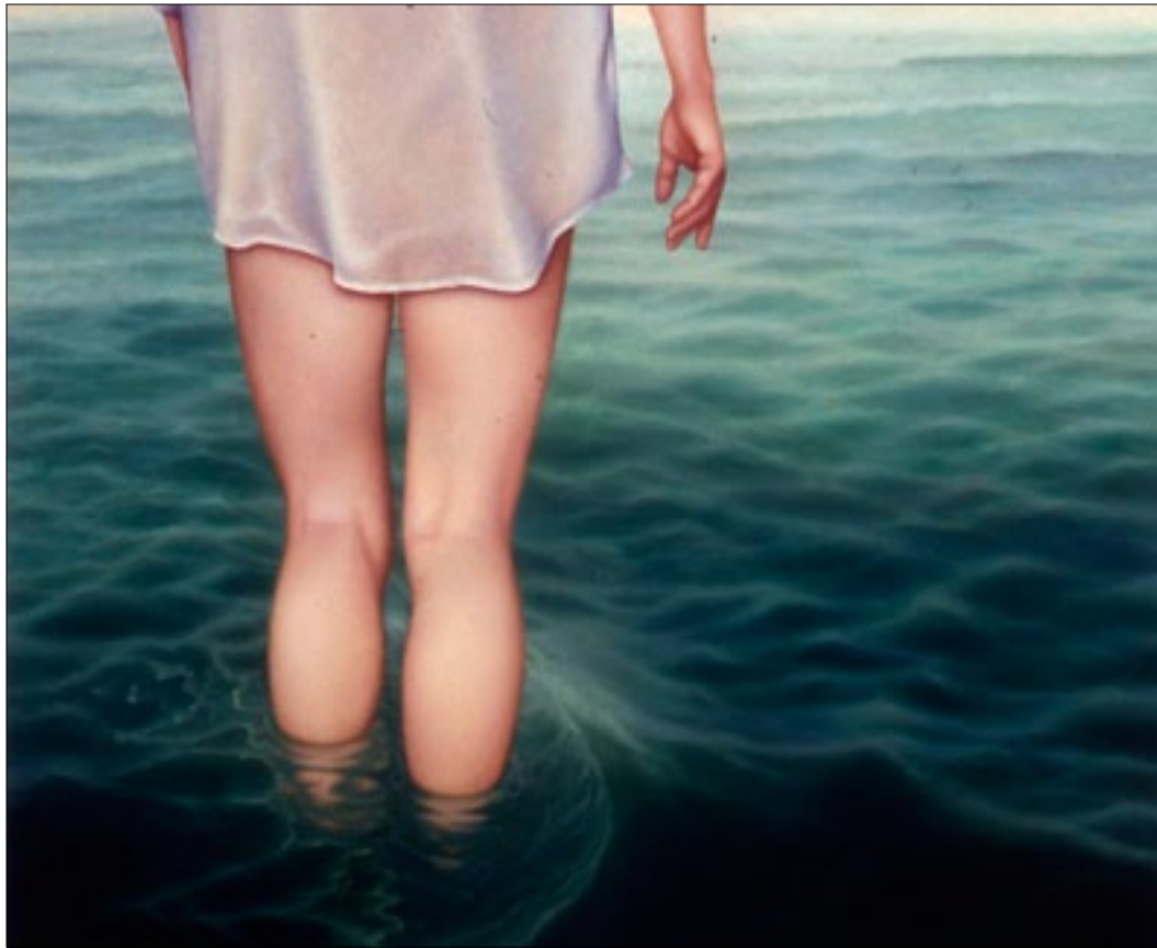
Departure oil on canvas 58"x 44"