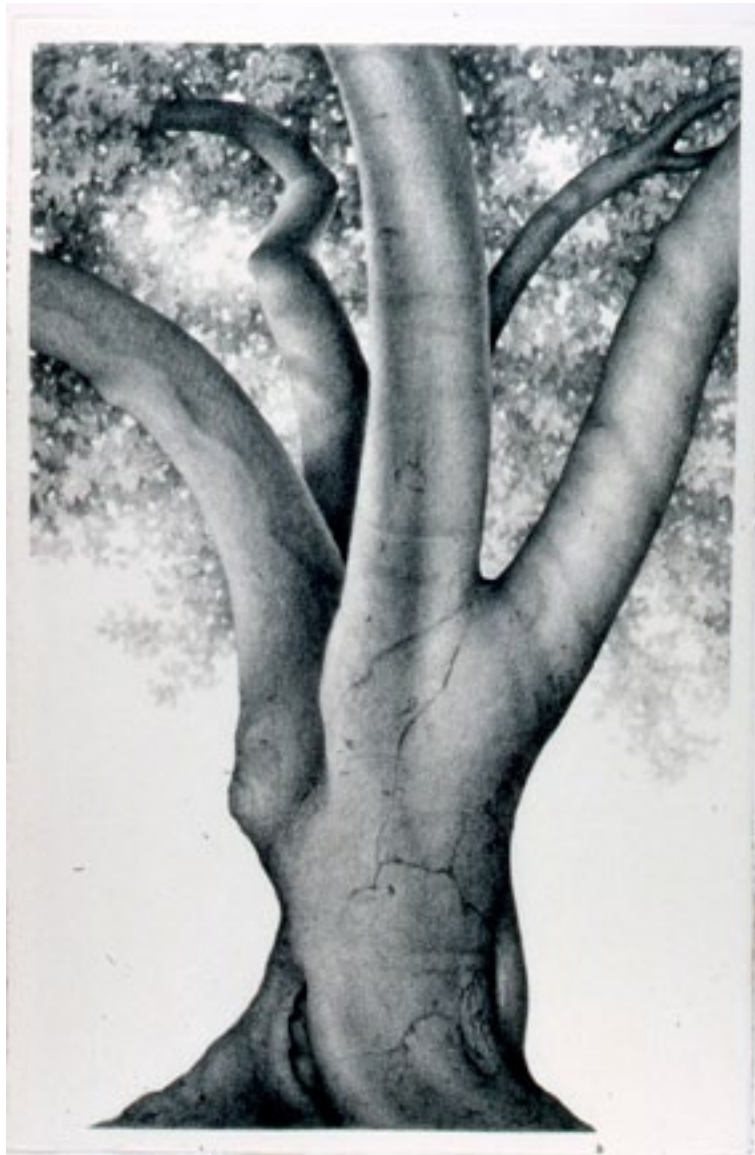
Leoli graphite and conte on paper 71"x 50"