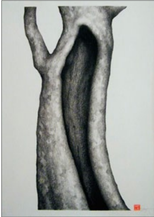
The Hollow graphite and conte on paper 40"x 32"