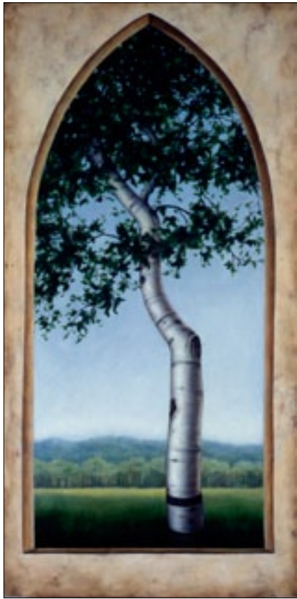
Birch 1 oil on canvas 48"x 36"