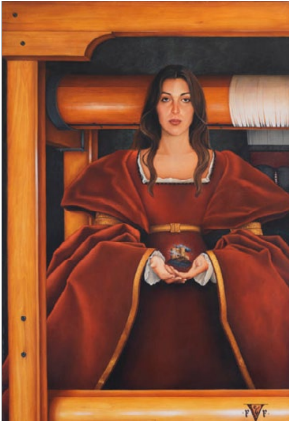
The Weaver oil on canvas 68"x 44"