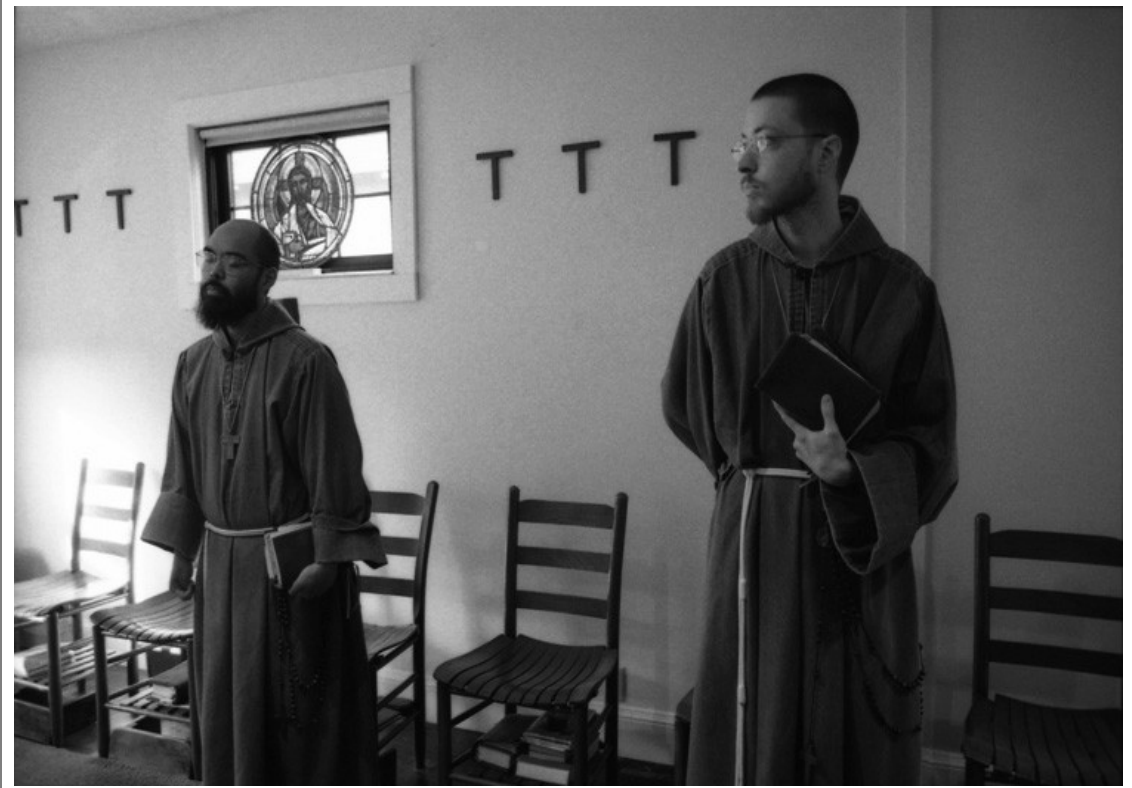
"Be content to have nothing. It's difficult, but it's a fun adventure." –Brother Giles