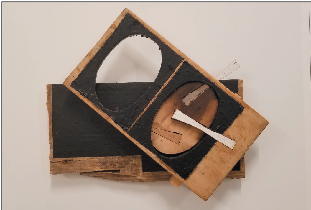
Dowser wood 19x20x4