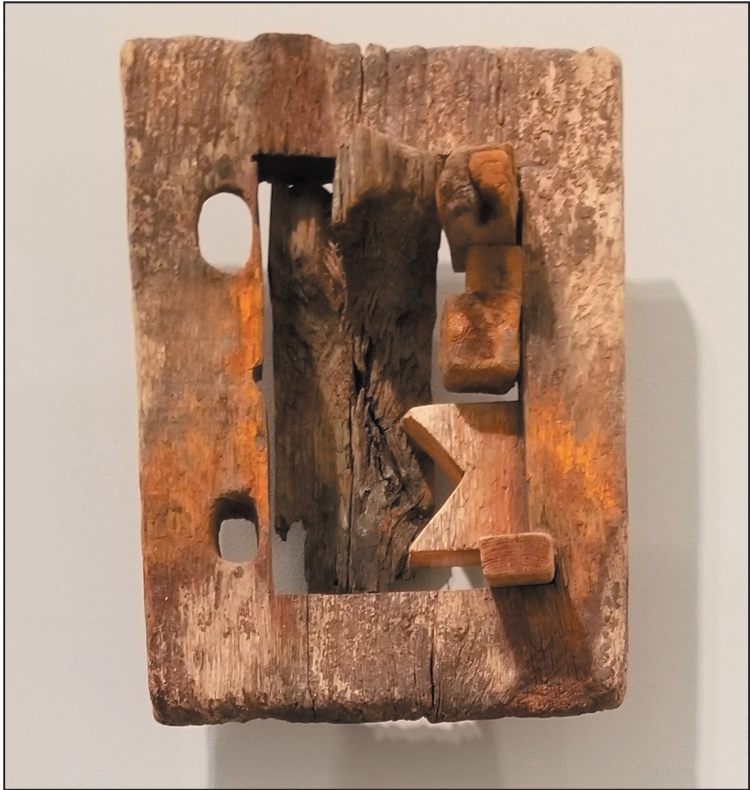
Lock Box Wood and rust 12x9x5