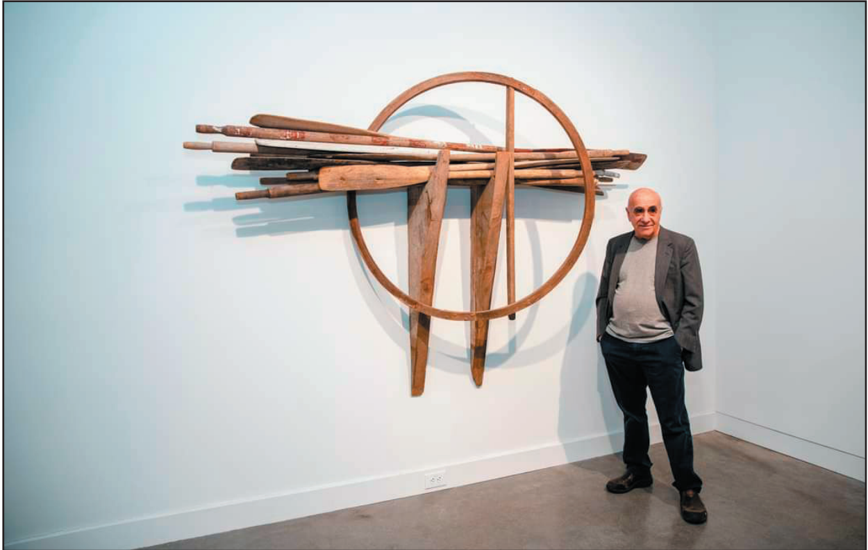
Cradle Wood 65x96x20