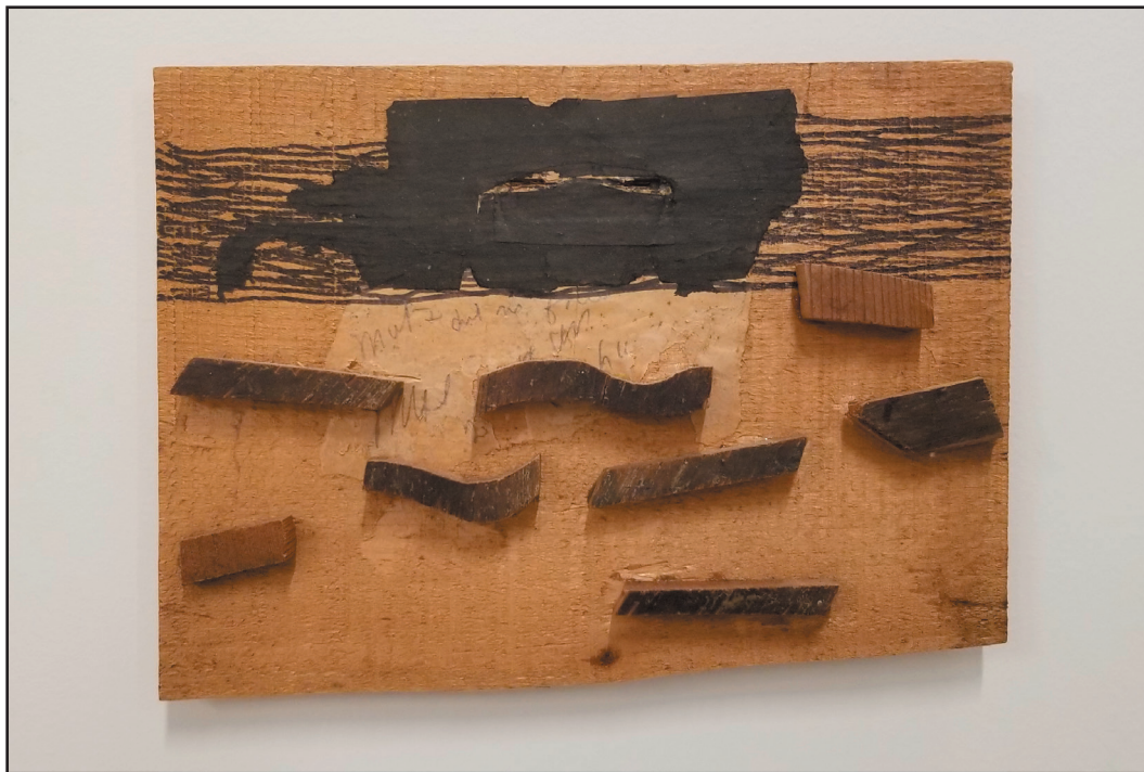
Harbor Wood, paper and ink 7x9x1