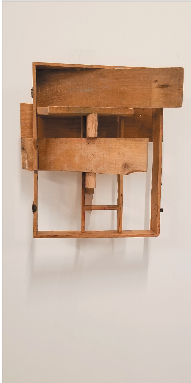
Painters Box Wood 18x15x11"