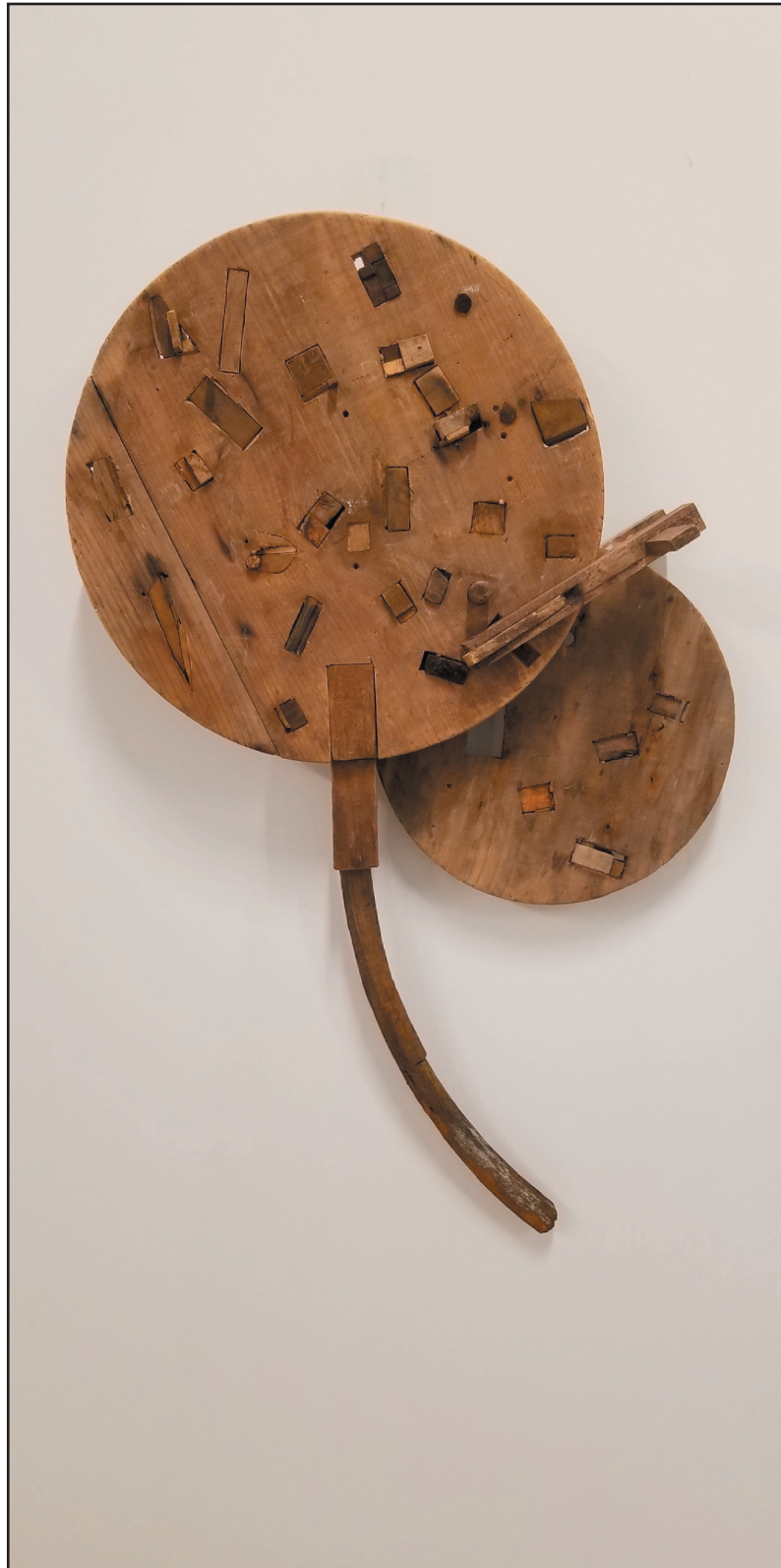
Quern Wood 38x24x9