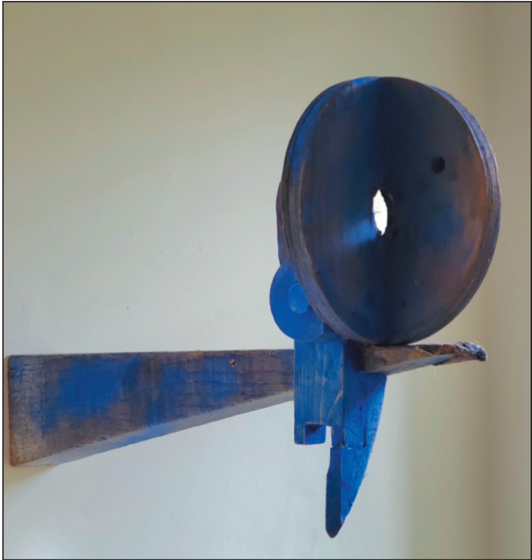
Baby Blue Wood 10x18x6