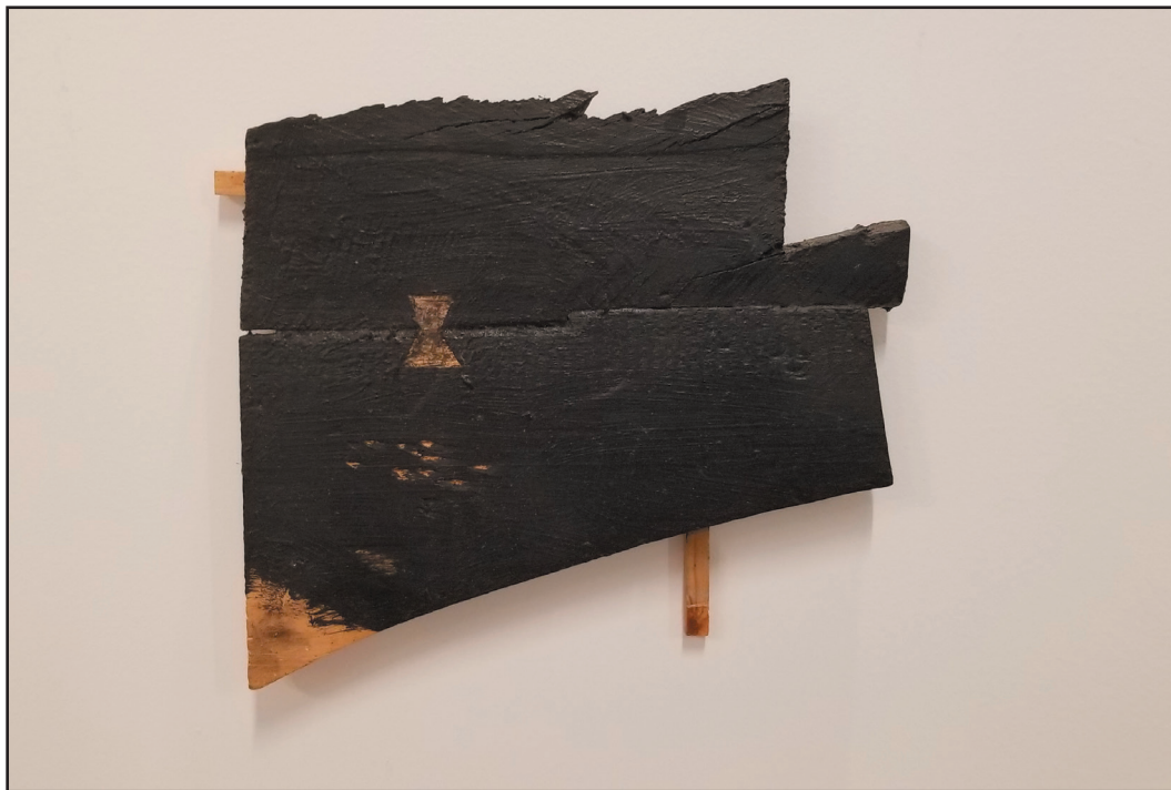
Black Ice 8x9