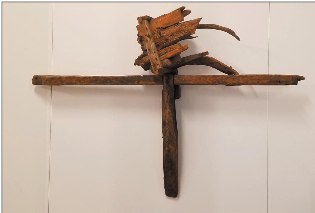
Rust Box wood and rust 32x48x9